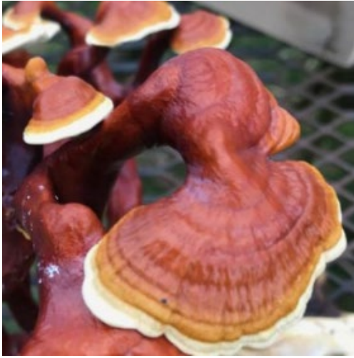
Reishi Mushroom fruiting body

Reishi is a medicinal mushroom that supports metabolism and immunity. Studies show that the polysaccharides of this mushroom promote the production of interleukin – 2 and can enhance the germ-killing capacity of T lymphocytes. Reishi glycans can also improve glucose control, thus improving metabolic balance. Also known as an adaptogen, Reishi has also been shown to help reduce chronic inflammation.