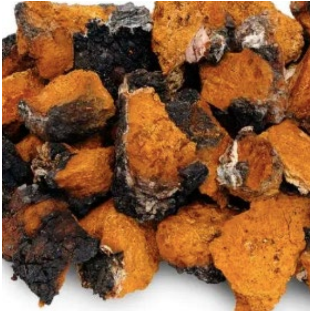
Chunks of Chaga fruiting body

Chaga mushrooms contain polysaccharides made up of xylulose, rhamnose, mannose, glucose, inositol, and galactose. It also has antioxidant compounds called phenolics. These compounds contribute to what is known as “early stage antiviral activity” by blocking the fusion of a virus to membranes of our cells. Phenolic compounds also protect lymphocyte DNA from oxidation, thus protecting the central information center of the immune system. Like other mushrooms, Chaga can improve blood glucose balance and promote liver health.